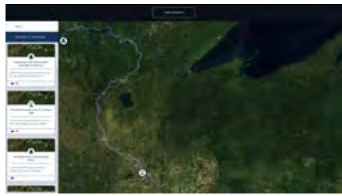
Interactive map interface